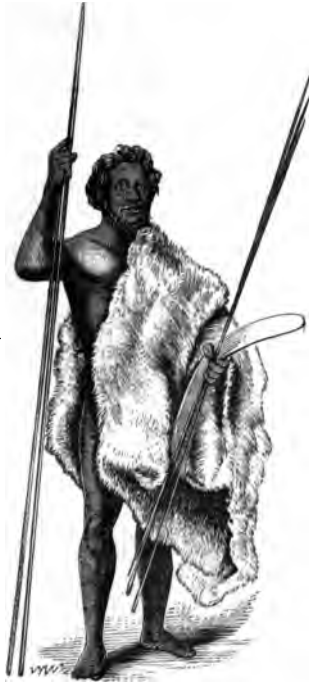
READY FOR WAR.

object aimed at, when the boomerang will return in a different direction, falling at his feet. They are not a bloodthirsty race, for very few are killed in their battles, preferring to take prisoners rather than